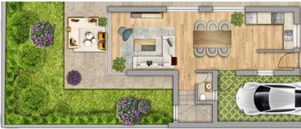
1 st floor