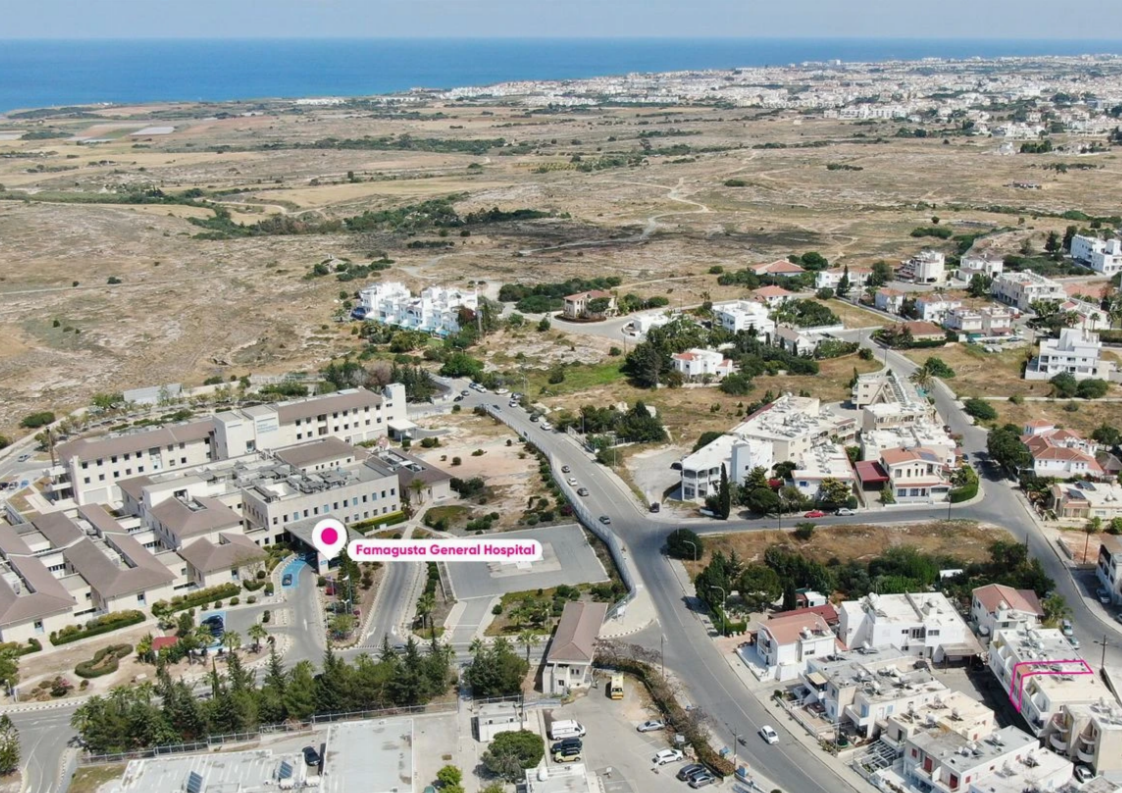
Famagusta General Hospital