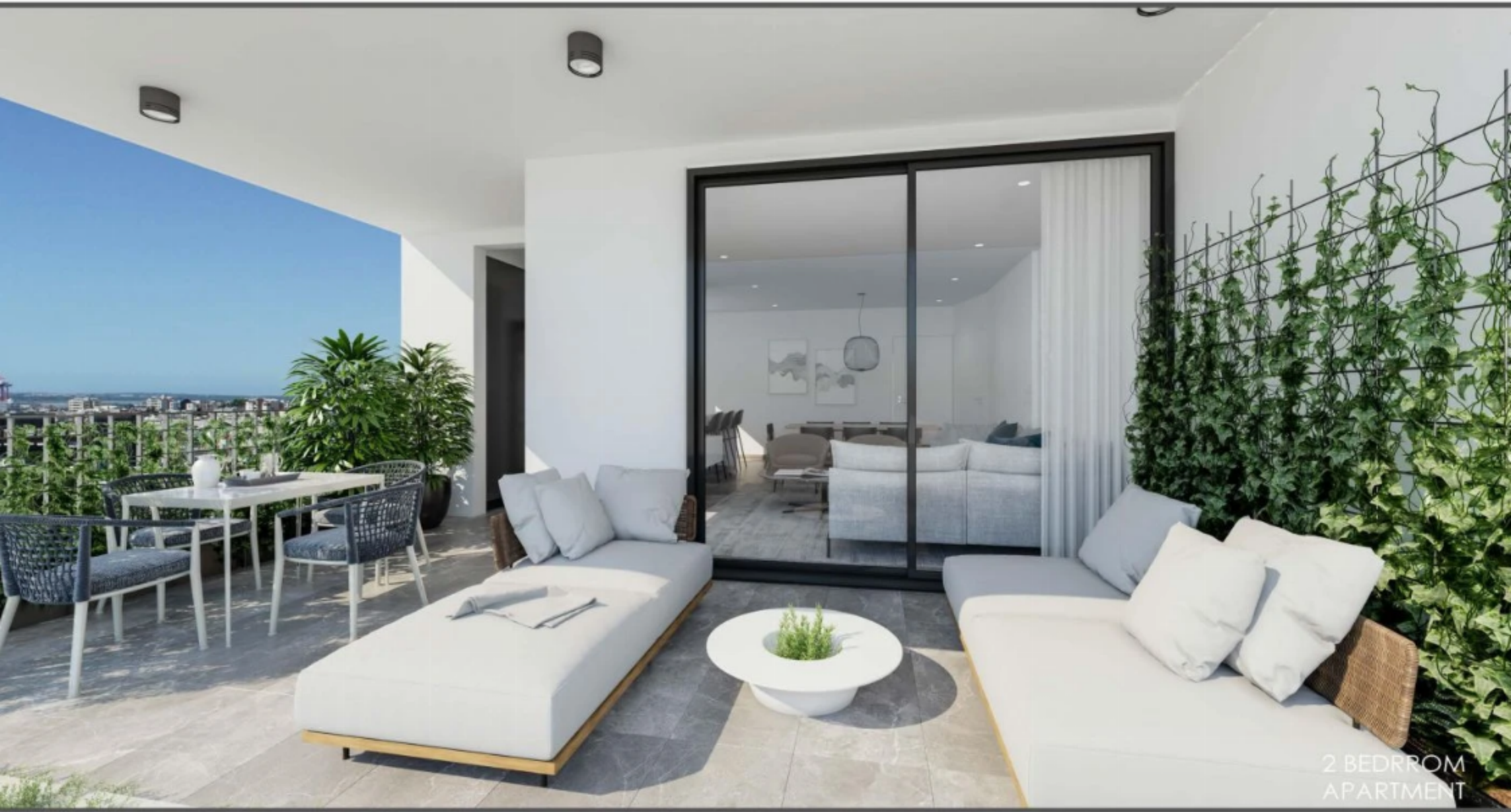
2 BEDROOM APARTMENT