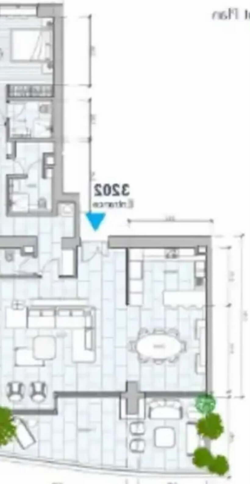
Preliminary Apartment Plan