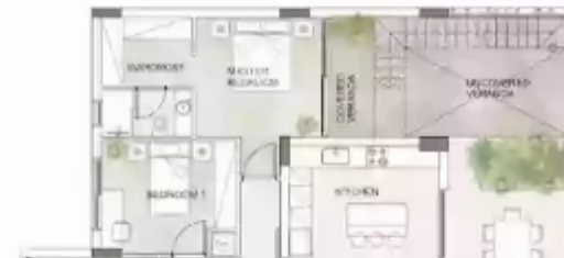
ROOF GARDEN - 402 1:100