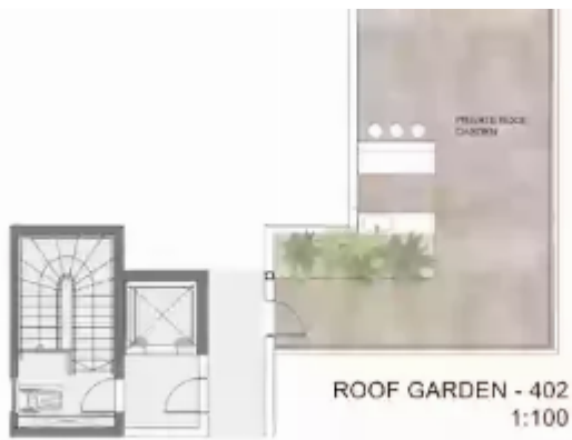
ROOF GARDEN - 402 1:100