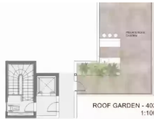
ROOF GARDEN - 402 1:100