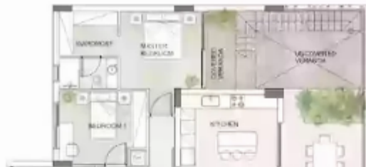
ROOF GARDEN - 402 1:100