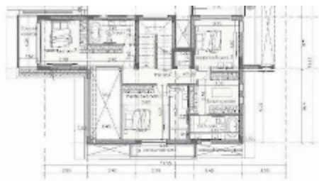
FIRST FLOOR LEVEL