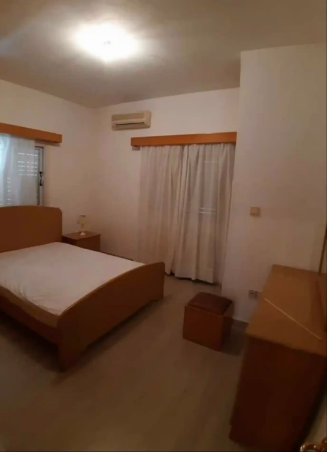
Main bedroom with shower and ac